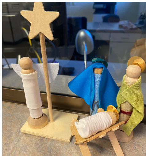
One of the clothespin nativity scenes made by our Church School kids.