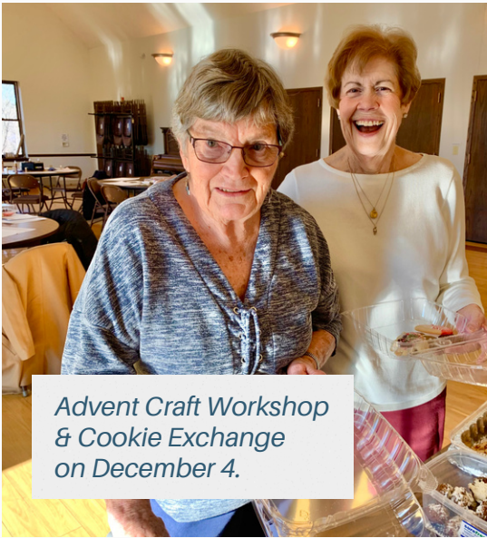
Advent Craft Workshop & Cookie Exchange on December 4.