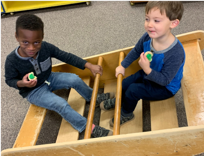
Church friends hard at play in the Nursery.