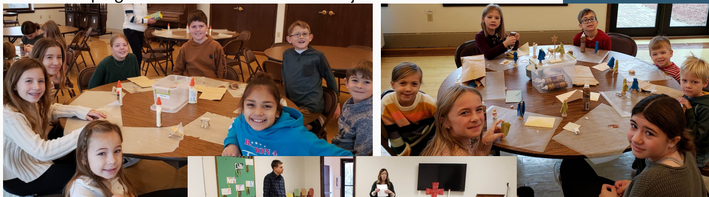
Our Church School group in action on December 11.

We will be putting our lessons into action by decorating thank you cards which will be sent by the Stewardship Team following their annual campaign. All children are welcome to join us!